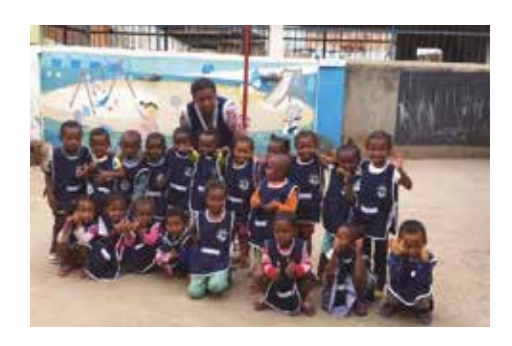
"14 preschools help 2300 children in highly vulnerable situations prepare to enter primary school"

The Foundation also supports the KOLOINA nonprofit association, which helps vulnerable families to establish their identification paperwork. It also organises mother-child workshops to strengthen their mutual bonds.